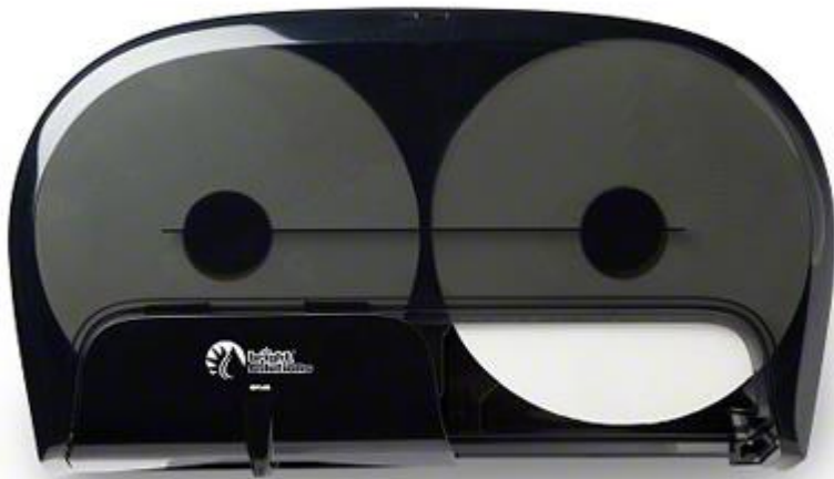
Dual Roll High Capacity Toilet Paper Dispenser - Black

Tork® Universal Quality High Capacity Tissue w/OptiCore® 12ct Case