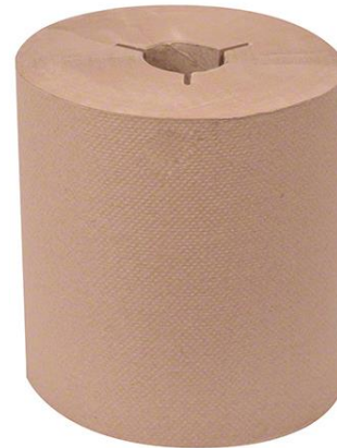
Tork® Universal Quality Roll Towel -8" x 1000', Nat. Item # BSL-TWHRTBN Satisfies those seeking to achieve green status for their facility and purchase toweling produced with methods less harmful to the environment. 8" x 1000', Natural

Your Full-Service Beverage Solution Since 1986