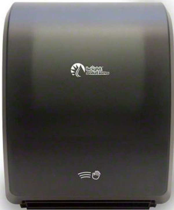
BSL Electronic HRT Dispenser - Black Item # BSL-TWDHRTE1B